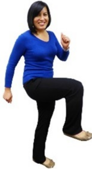
March in Place